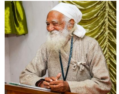
Padma Bibhushan Sunderlal Bahuguna

Thus it is absolutely important to learn how to live personally and professionally in a manner that supports ecologically, socially and economically healthy environments and living communities. This will be possible only through better awareness generation, education and understanding about sustainability and through an absolutely new approach of leadership in development.