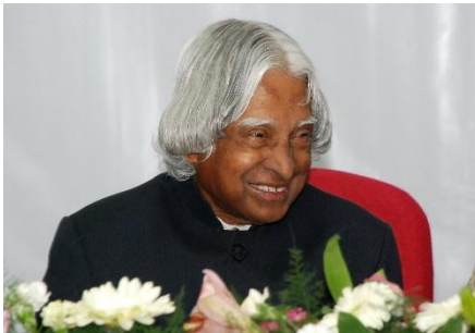
Bharat Ratna APJ Abdul Kalam

Sustainability occupies the centre stage in our life in the fast changing world. “Sustainability” is much more than a recent buzzword- a way of life and living in harmony with nature. Sustainability envisions a just and peaceful self-sustaining society that embraces the basic principles and value system of symbiotic living. Sustainable development has been the central focus for the future development strategies. The biggest challenge to sustainability is the fact that the Earth has finite resources but an indefinitely growing population. By the year 2050, there will be over nine billion people on Earth whose livelihood will depend on these finite