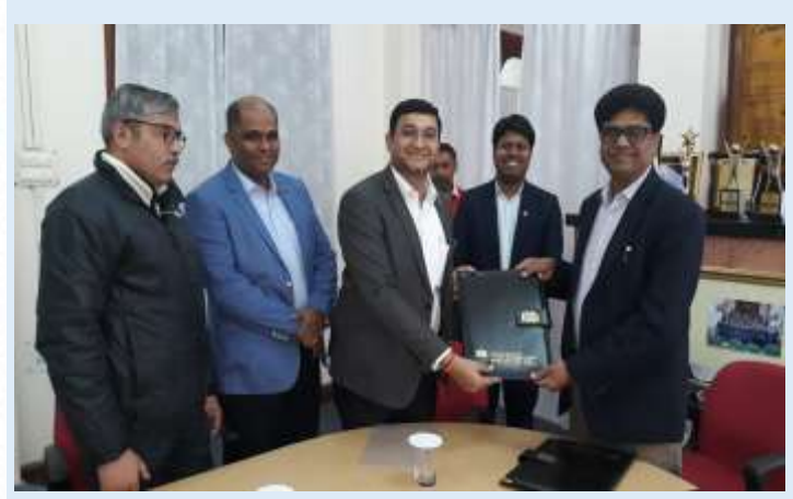
Officials of IIM Shillong and ICSI New Delhi during the signing ceremony

This marks the beginning of a new chapter of cooperation between IIM Shillong and ICSI and is expected to lead to wider co-operation between them.