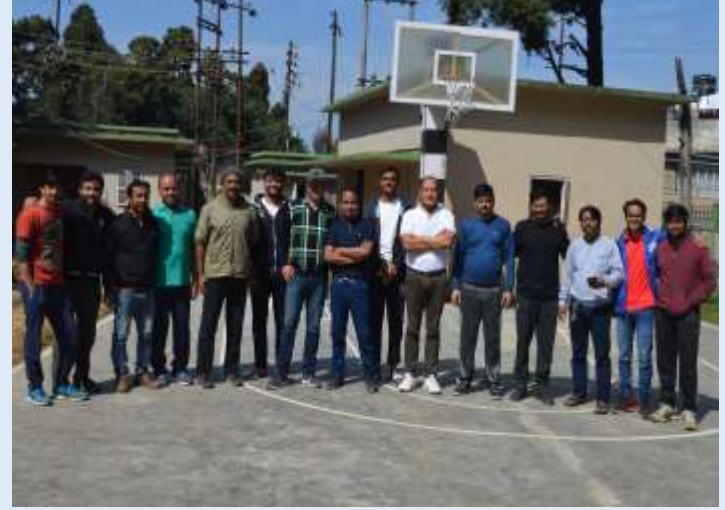
Team photograph of the Cricket Exhibition Match

Phone No: +91 364 2308008Email: sky@iimshillong.ac.in