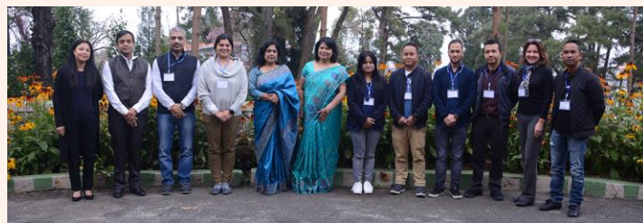
The group in Finance for Non Finance Professionals

The 3 days training program is being facilitated by in house faculty. The methodology included Case studies, Classroom Lectures and Management Games facilitated by resource faculty. The participants from varied back ground and functions added diversity as well as encouraged inter peer learning and interaction during the training program.