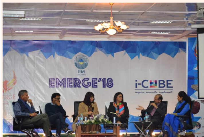
Panel Discussion on Emerging Trends on Handicrafts underway during EmergE 2018