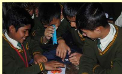
Fun-Sci: Students looking at the world through a kaleidoscope made by them

For me, personally, the journey of this non-profit start-up has been full of challenges, learnings and satisfaction. As we completed two years of existence and also broke-even financially in the last month, I feel confident that TREE is headed in the right direction. At the time of conceptualizing the TREE Foundation, we had agreed on one principle unanimously – that, the individual journeys of its