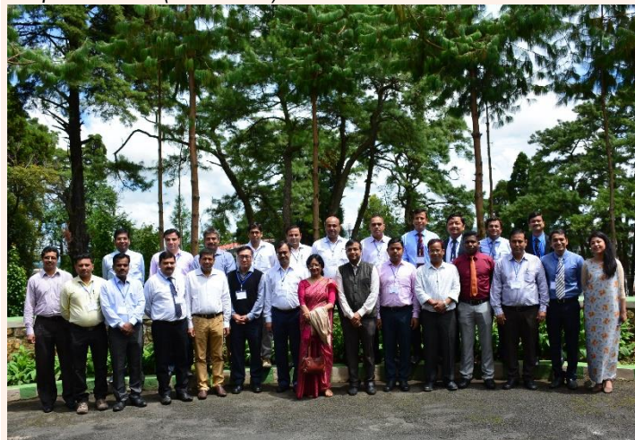
Participants of the "General Management with emphasis on Leadership Competencies" for Senior Executives of Indian Oil Corporation Ltd (Second Batch)