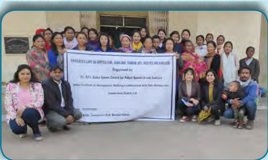
Photo- Awareness Campaign at Dimapur

The Centre organised one awareness campaign at BSNL Hall, Dimapur for the entrepreneurs of Handicrafts, Horticulture, Handloom on different government projects and programmes. Research Assistants of the Centre delivered a lecture on dif-