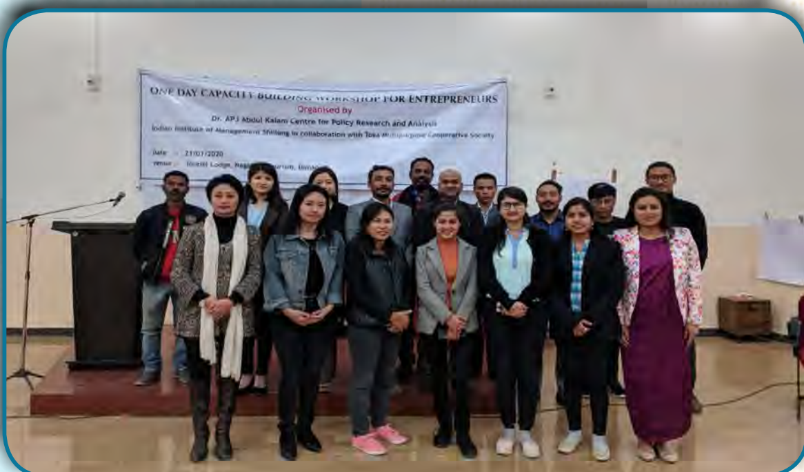
Photo - Participants of Capacity Building Workshop held at Dimapur

The Centre also organised a One Day Capacity Building workshop for the entrepreneurs of Arunachal Pradesh at Chongkham, Namsai in collaboration with Block Mission Management Unit, Chowkham and Seven Sisters Development Assistance (SeSTA), Assam. It was attended by 40 entrepreneurs of the State.