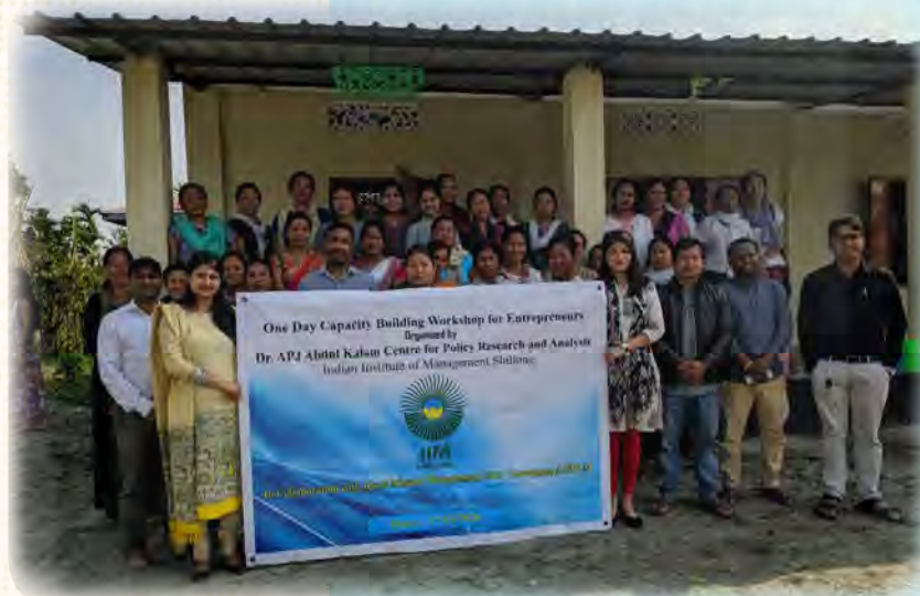
Photo - Participants of Capacity Building Workshop held at Namsai