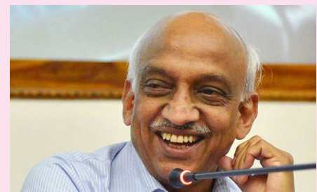
Former Chairman of ISRO Shri AS Kiran Kumar

Shri. AS Kiran Kumar, Scientist and former chairman of ISRO during his lecture on the topic 'ISRO's Space Journey: A Saga of Innovation and Delivery' said, “Dr. Kalam worked and contributed to the development of the Indian Space Research Organisation.