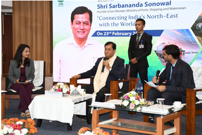
PHOTO GALLERY GLIMPSES OF FEBRUARY EVENTS