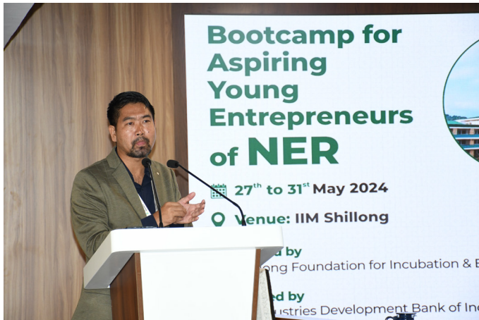
PHOTO GALLERY GLIMPSES OF MAY EVENTS