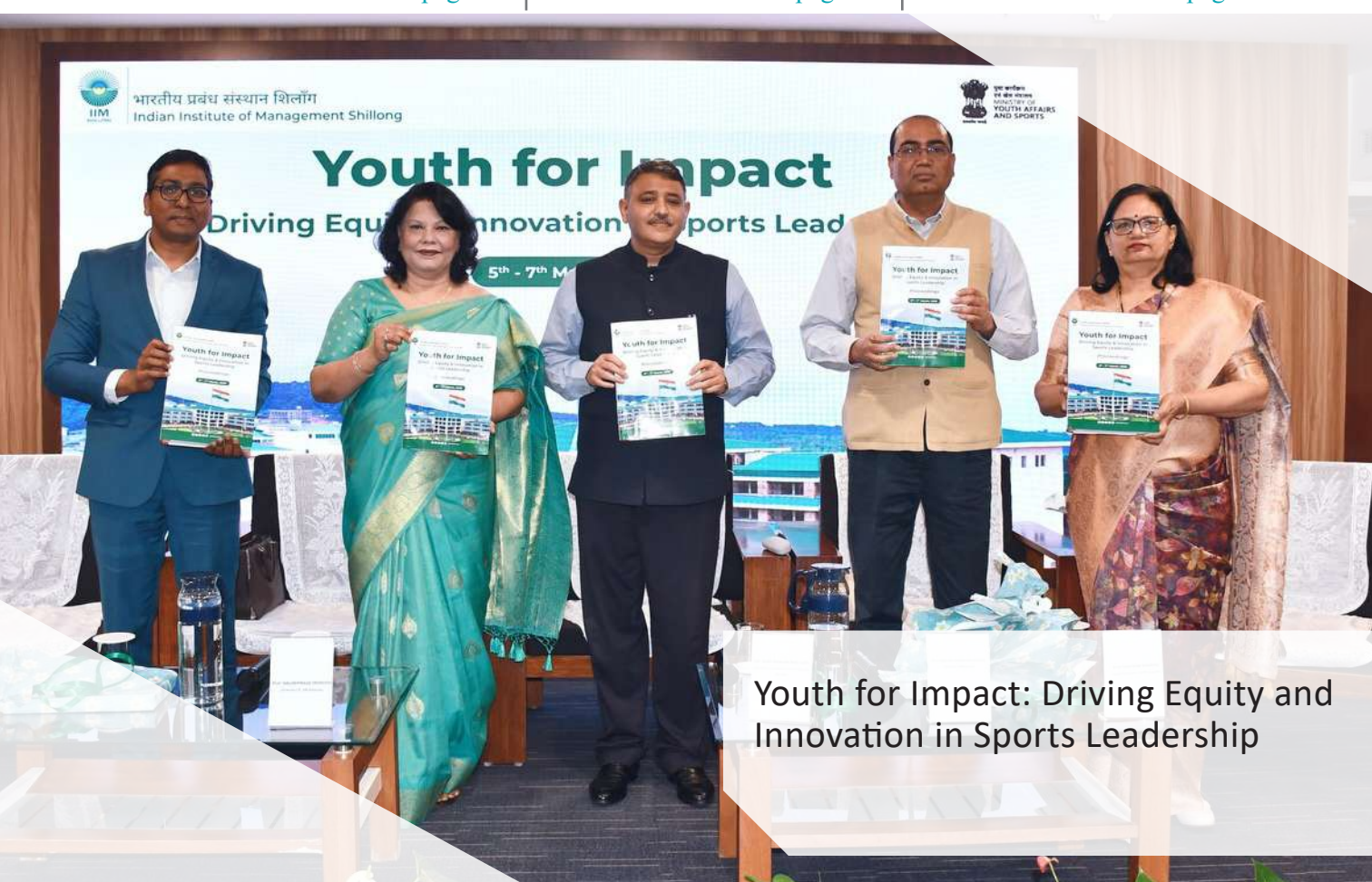
Youth for Impact: Driving Equity and Innovation in Sports Leadership